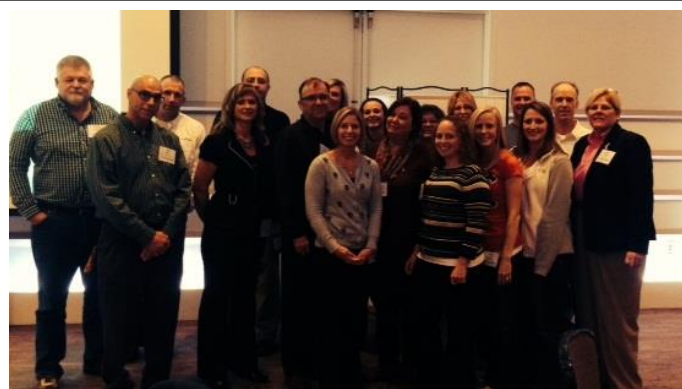
Many professionals from the Lenawee legal community attended a heroin summit

Billboard at Promedica Bixby Hospital by LSAPC member and RN