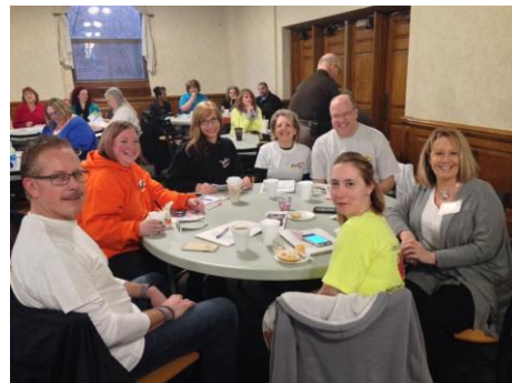
Lenawee Addiction Summit 2016